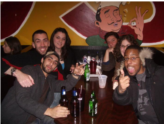
Brothers enjoying an evening out at the University of Cincinnati