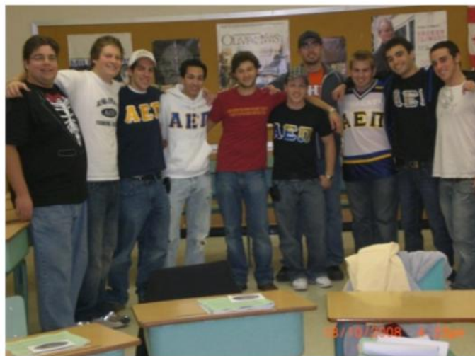
Masters from each of the ten Canadian chapters