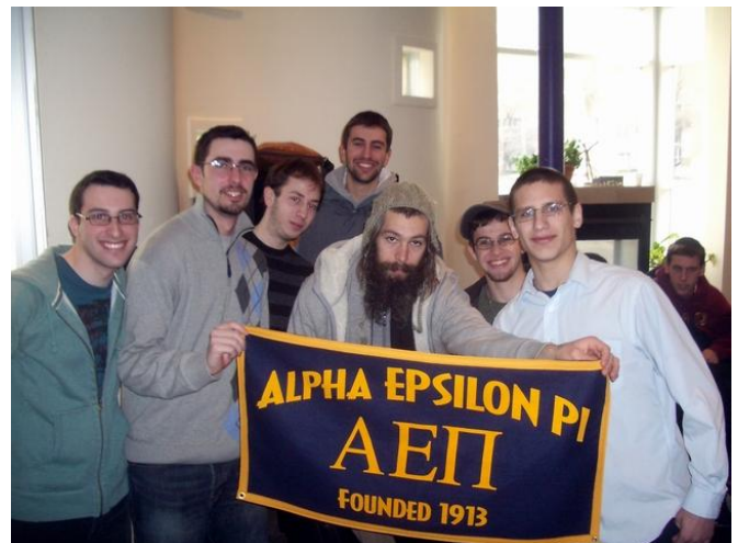
Tau Omega Brothers with Jewish musician Matisyahu