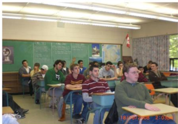
Below: Brothers participating in Canadian Conclave workshops