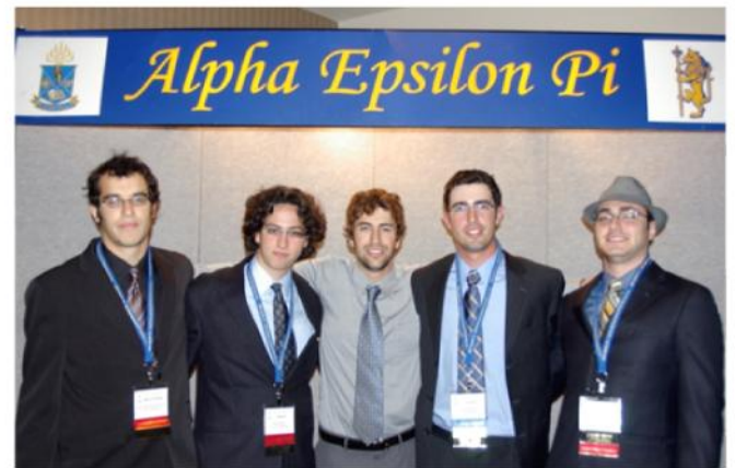
Tau Omega delegates at Convention's evening reception

Our chapter was one of several to receive a reward recognizing our philanthropy work, which was well deserved in light of the great contributions that Tau Omega has made to the community over the past year. We attended Supreme Council, which is fraternity-wide meeting in which new senior members are sworn in as international leaders of the fraternity. There were also several workshops which took place over the weekend, focusing on everything from philanthropy to risk management at fraternity events, as well as individual seminars for each position of the chapter executive board. Aside from being fun, these events were highly educational in understanding what AEPi is all about, from the level of the international fraternity down to the level of the roles of each individual brother. (Continued on next page)