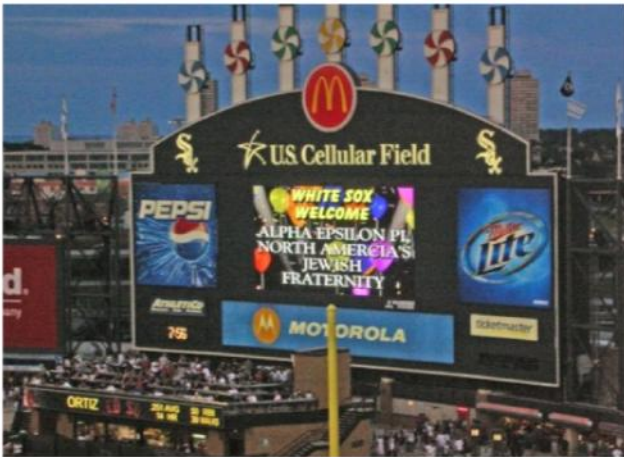
Scoreboard welcomes Alpha Epsilon Pi, courtesy of Alumnus Jerry Reinsdorf

Every year, the Alpha Epsilon Pi Fraternity holds a convention at which all of its chapters gather together. This year, the 95 th Anniversary Convention of AEPi was held in Chicago at the Hyatt Regency McCormick Place hotel and convention center over five days (Aug. 6-10). Several brothers from the Tau Omega chapter, along with brothers from several other Canadian chapters took a bus together down to Chicago to attend Convention.