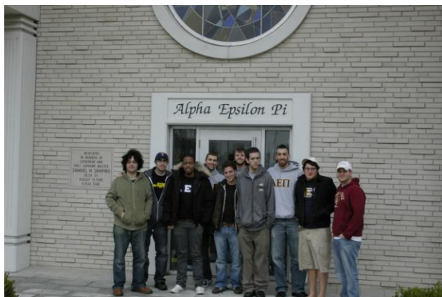
Tau Omega and Omicron Deuteron Brothers pose at Alpha Epsilon Pi International Headquarters