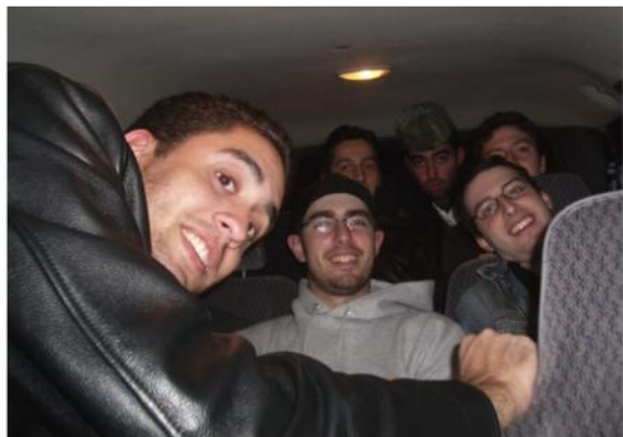
Above: Canadian Conclave delegates from Tau Omega

Alpha Epsilon Pi Fraternity organized its first major Canadian conclave in Niagara Falls this past October. A monumental event for all, this conclave marked the first inter-fraternal gathering of Canadian brothers representing all of the Canadian chapters. Nine delegates from the Tau Omega (University of Toronto) chapter attended the conclave, joining brothers from the ten other chapters in Canada.