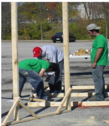
Tau Omega Brothers hard at work building their Sukkah