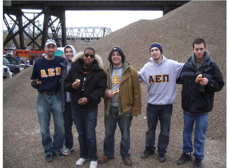
Above and Below: Brothers enjoying a day of tailgating and NFL football action