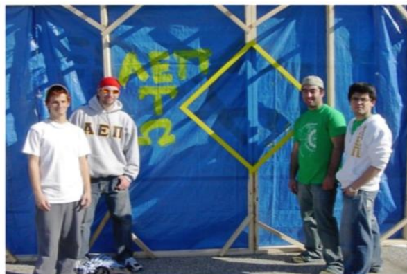
Brothers posing with the finished product